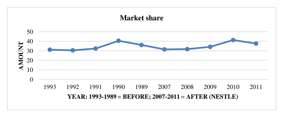
Figure 2: Graphical representation of the Market share Growth of Nestle Nigeria Plc Pre-packaging and post-packaging periods.

Figure 1 shows the graphical representation of the market share volume of Cadbury Nigeria Limited. From the Figure, we see that there was an increase in the market share volume of the company (Cadbury) from 1990 - 1993 when the re-packaging of products was done. After the repackaging was done, there was a slight increase then a steady fall in their market share volume not until 2010 when the company witnessed an increase in their market share volume.